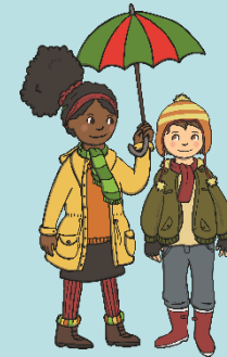
Boys, girls, women and men