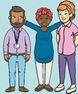
People of different races