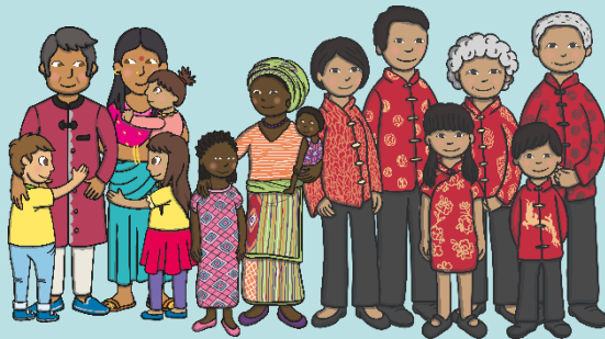
People of different religions