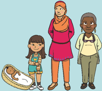
People of all ages

Everyone in the world has the same rights.