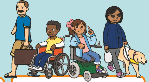
People with disabilities