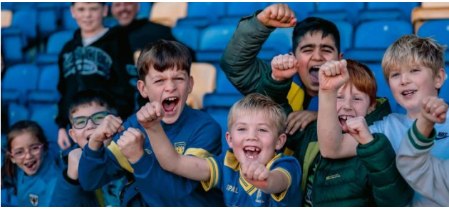
A few of our MPS children photographed at a local football match!