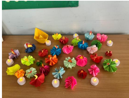
Diwali paper lights made by Year 4.